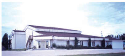
Steinbach 55+ Centre